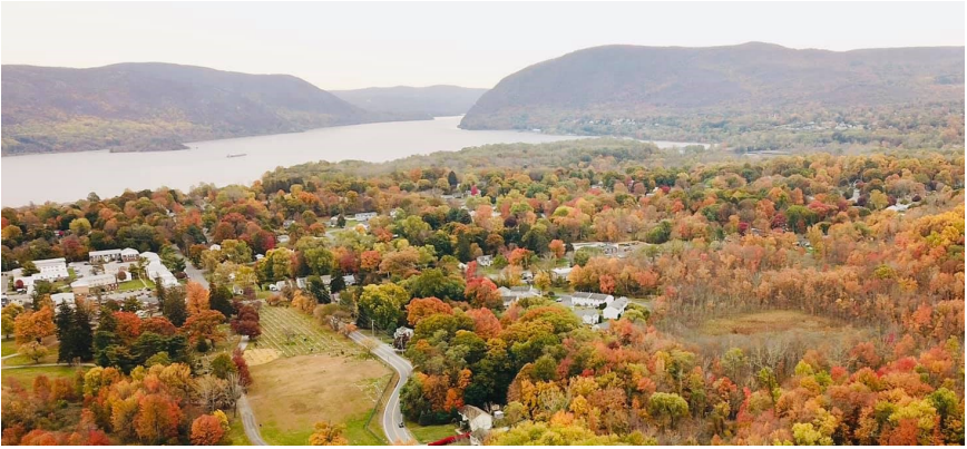
Autumn view of Erie Avenue looking towards the scenic Hudson River.

The New Windsor elected officials and employees are here to assist you in the best way possible. If you have questions, need information, or would like to express an opinion, please contact us. Your input helps us to serve you better.