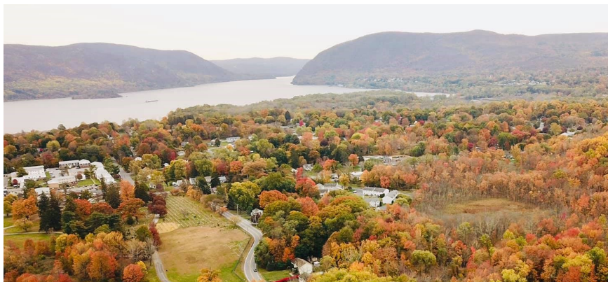
Autumn view of Erie Avenue looking towards the scenic Hudson River.

The New Windsor elected officials and employees are here to assist you in the best way possible. If you have questions, need information, or would like to express an opinion, please contact us. Your input helps us to serve you better.