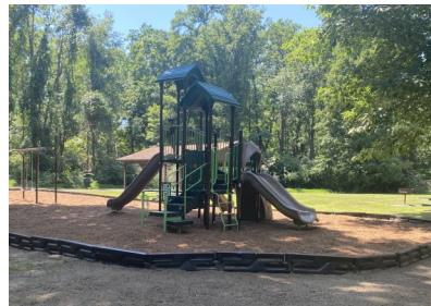
Ruscitti & Plum Point Parks, Renovated Summer of 2020